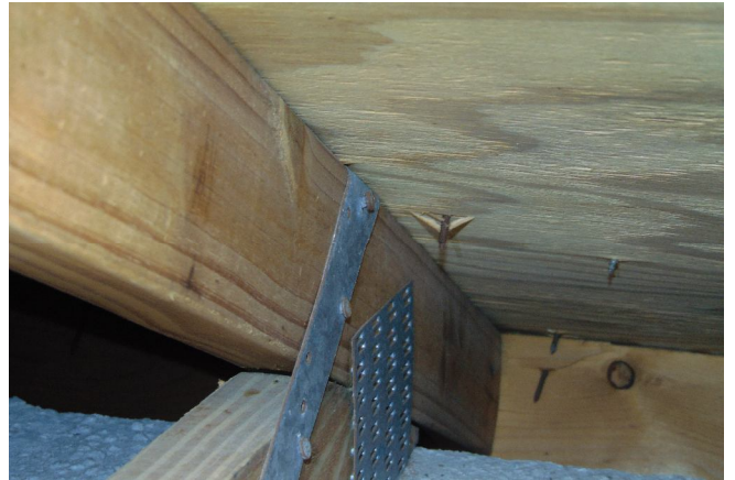
Roof to wall 3 nails each side