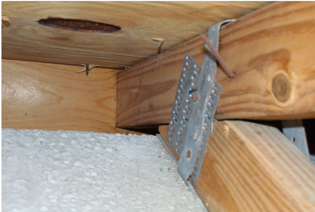
Roof to Wall 3 nails each side