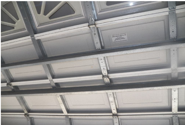
Non-Impact Rated Garage Door